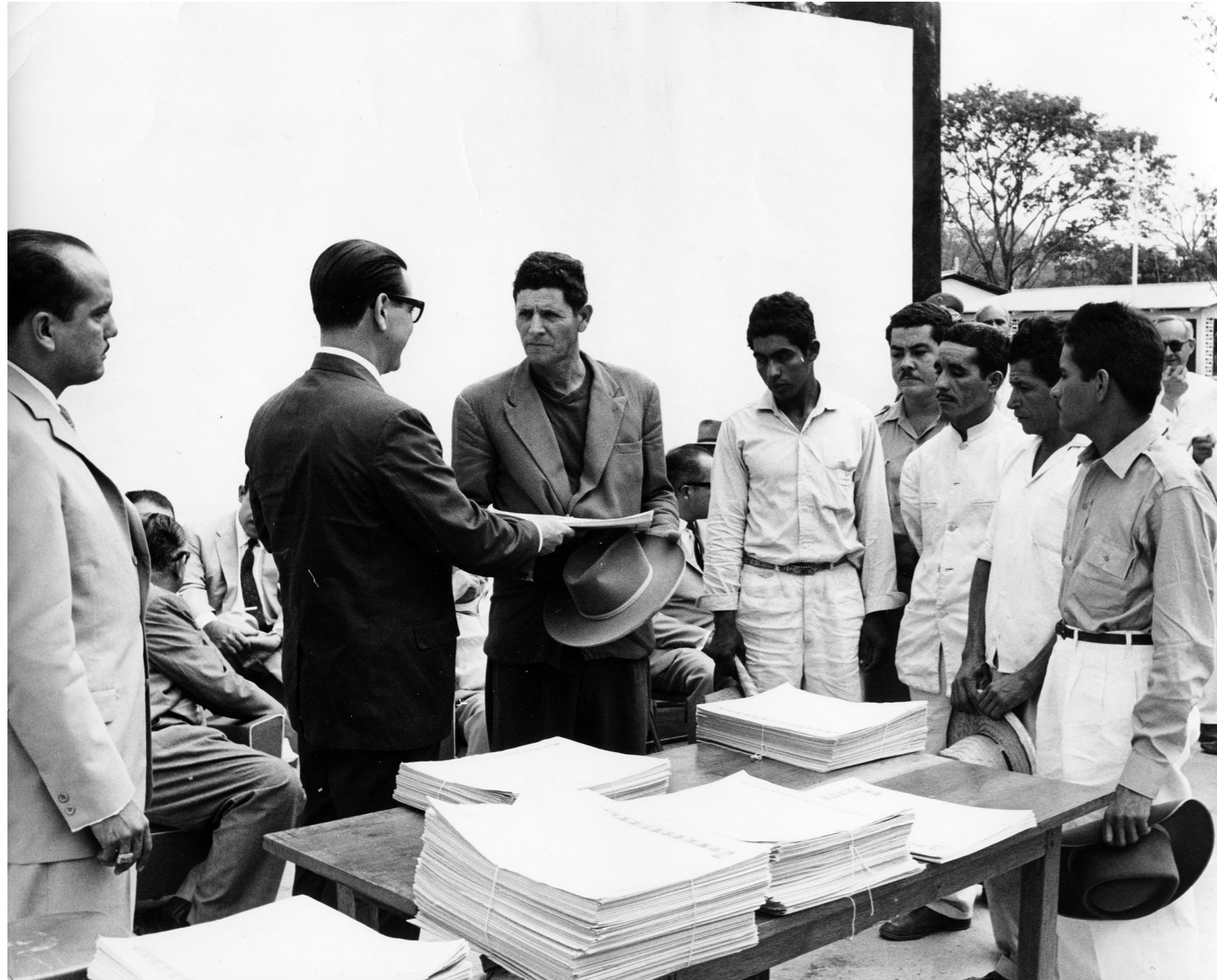
Figure 8. Handing over of agrarian reform titles to Venezuelan peasants and producers by the government of Rómulo Betancourt around 1963.

often resulted in clusters of multiple units, constituting a kind of hamlet. This accumulated experience in working with rural communities—and the success of the PNV in the eradication of malaria, along with the recognition it brought the country—created the conditions for a unique pairing of agrarian reform policies and the extensive provision of rural housing. Beyond questions of technical expertise, and more in line with the ideological nature of modernization, the government also continued to see peasants as a population requiring education, making the state's project of democratizing the countryside also a civilizing one.