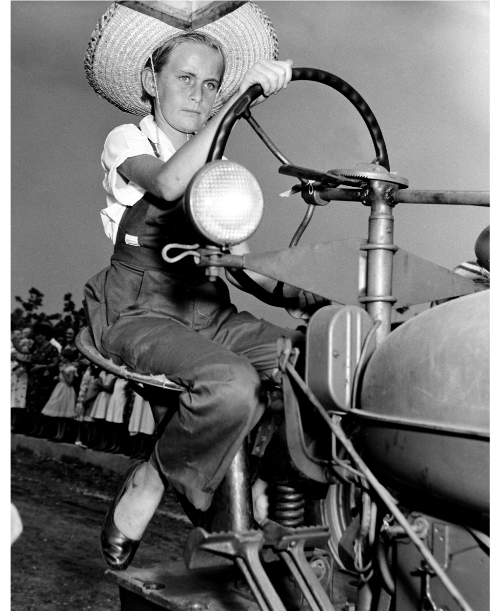
Figure 3. Parade of tractors driven by the children of immigrant settlers in the agricultural colony of Turén.

The same dispersed settlement pattern was also employed in Turén, locating housing units within the cultivated area and clustering them in groups of four at road crossings (Eidt, 1975). As Jacob O. Maos argues, this settlement