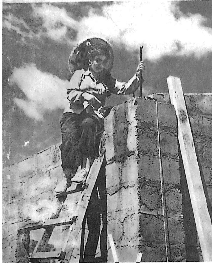
Figure 6. State propaganda promoting the work of the Rural Housing Division, stating that "on the rubble of the past, a new life is born".

PROGRAMA NACIONAL DE VIVIENDA RURAL. - DIRECCION DE MALARIOLOGIA Y SANEAMIENTO AMBIENTAL. MINISTERIO DE SANIDAD Y ASISTENCIA SOCIAL