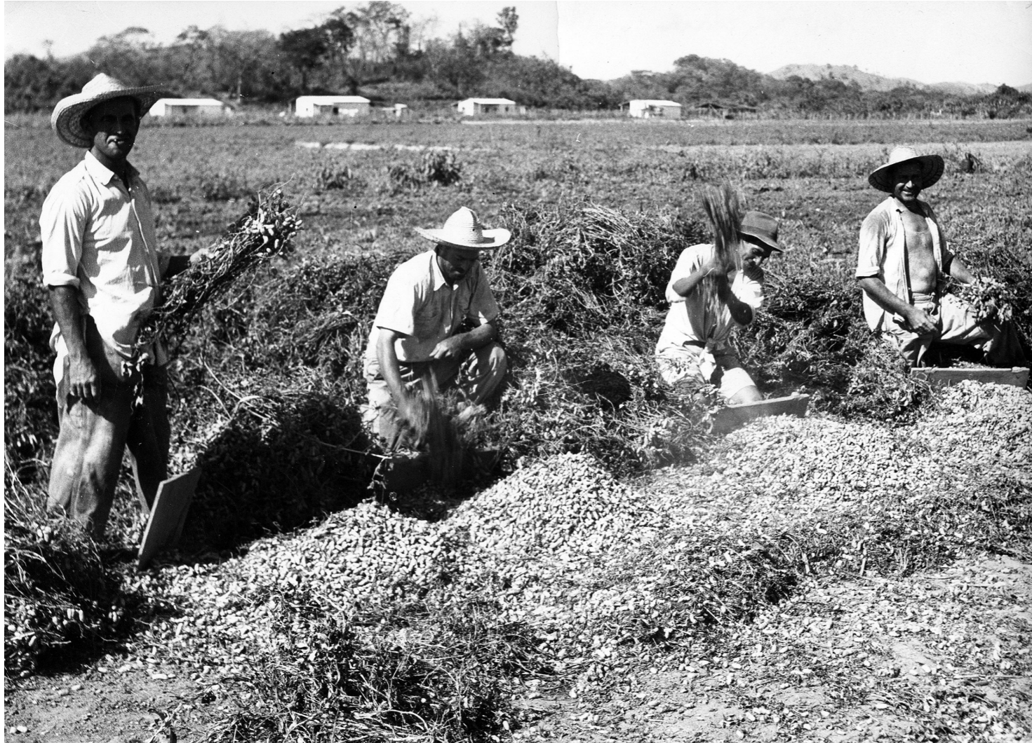
Figure 4. Venezuelan peasants picking a peanut harvest.

pattern prioritizes agricultural production over any other variable, as it reduces the farmer's travel time to the fields and lowers transportation costs at the expense of hindering the provision of services and infrastructure and making institution building and cooperation among farmers more difficult (Maos, 1984). In Turén, where the distance between housing clusters was almost one kilometer in areas with macro-parcelas and 255 meters in those with micro-parcelas , these observations are clearly valid! [Fig.5]