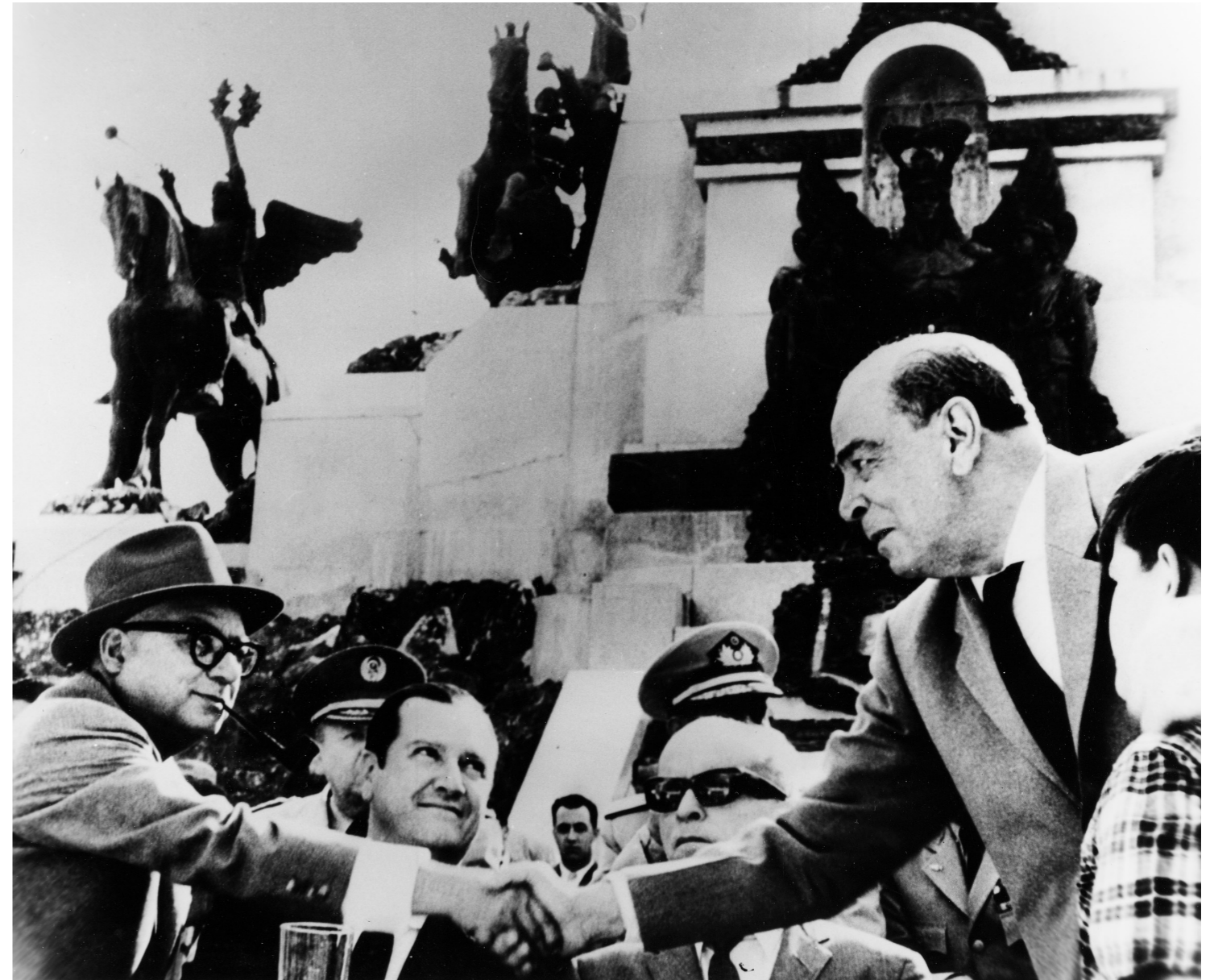
Figure 1. President Rómulo Betancourt and former president Rómulo Gallegos at the act of enactment of the Agrarian Reform Law in March 1960.

This technical cooperation agreement helped Venezuela's agrarian reform quickly gain momentum, become a model for other agrarian reforms in Latin America, and train an elite group of engineers, agronomists, sociologists, economists, zotechnicians and architects specializing in new forms of rural development. However, it would be a mistake to believe that this achievement was solely due to the ideas and methods contributed by the Israeli experts. Numerous experiences prior to that technical cooperation agreement, on subjects as varied as irrigation systems, the planning of new agricultural