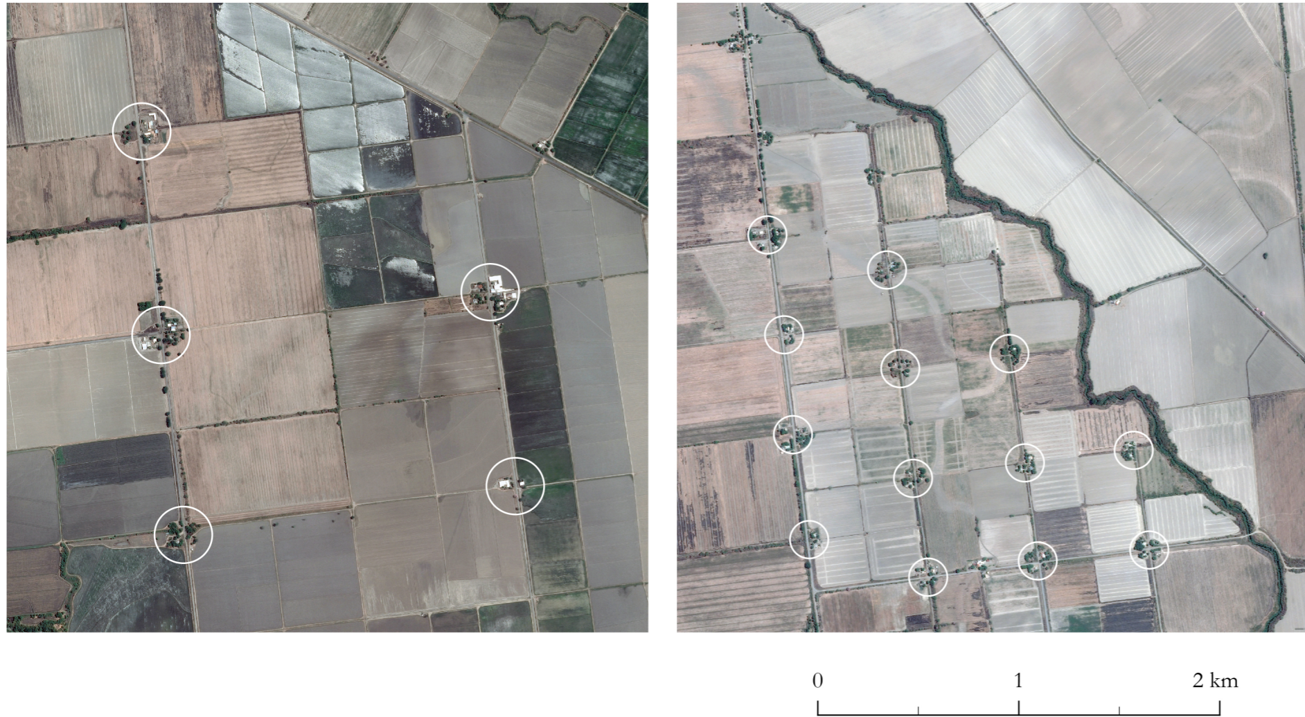
Figure 5. Scale comparison between macro-parcelas and micro-parcelas in the agricultural colony of Turén.

Ministry of Health, as scientists and technicians thought the health crisis stemmed from traditional building techniques. They saw traditional dwellings as a source of insalubrity and misery, basing their premises on several assumptions that were echoed by official propaganda (Contreras et al., 2015).